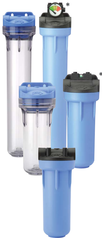
*Shown with differential gauge. Gauges sold separately.

VERSATILE DESIGN ACCEPTS MULTIPLE CARTRIDGE SIZES IN A VARIETY OF APPLICATION SETTINGS